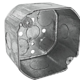
3" / 4" Octagonal (Metal)