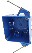
3" / 4" Square (Plastic)