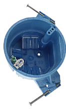
3" / 4" Round (Plastic)