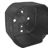
Fire Rated J-Box

Note: A 2-1/8" deep octagon junction box is recommended for through circuit wiring applications.